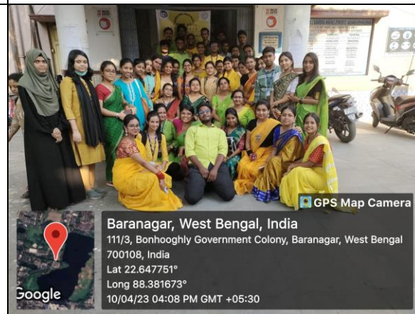
Baranagar, West Bengal, India 111/3, Bonhooghly Government Colony, Baranagar, West Bengal 700108, India Lat 22.647751° Long 88.381673° 10/04/23 04:08 PM GMT +05:30