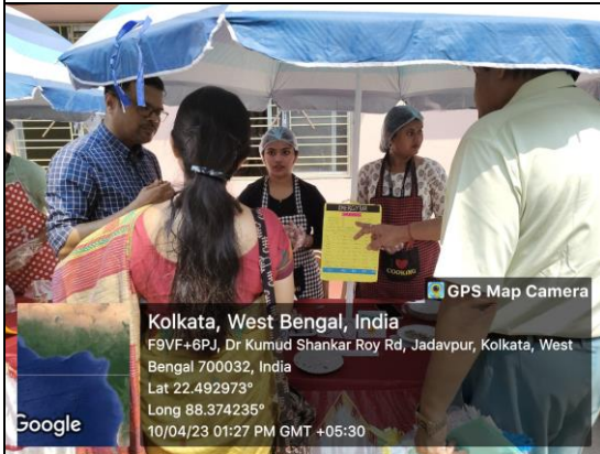
Kolkata, West Bengal, India F9VF+6PJ, Dr Kumud Shankar Roy Rd, Jadavpur, Kolkata, West Bengal 700032, India Lat 22.492973° Long 88.374235° 10/04/23 01:27 PM GMT +05:30