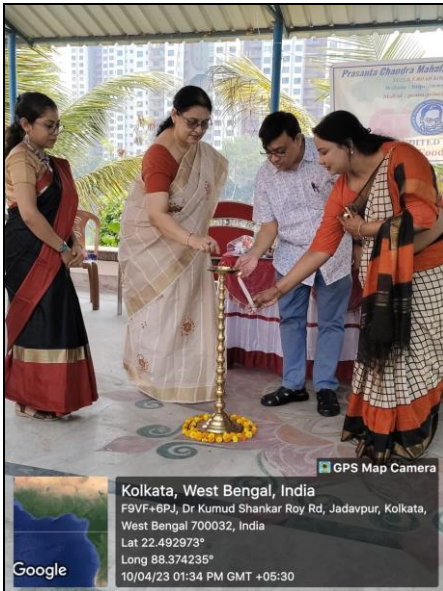
Kolkata, West Bengal, India F9VF+6PJ, Dr Kumud Shankar Roy Rd, Jadavpur, Kolkata, West Bengal 700032, India Lat 22.492973° Long 88.374235° 10/04/23 01:34 PM GMT +05:30