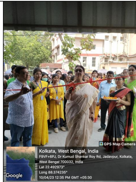
Kolkata, West Bengal, India F9VF+6PJ, Dr Kumud Shankar Roy Rd, Jadavpur, Kolkata, West Bengal 700032, India Lat 22.492973° Long 88.374235° 10/04/23 12:35 PM GMT +05:30