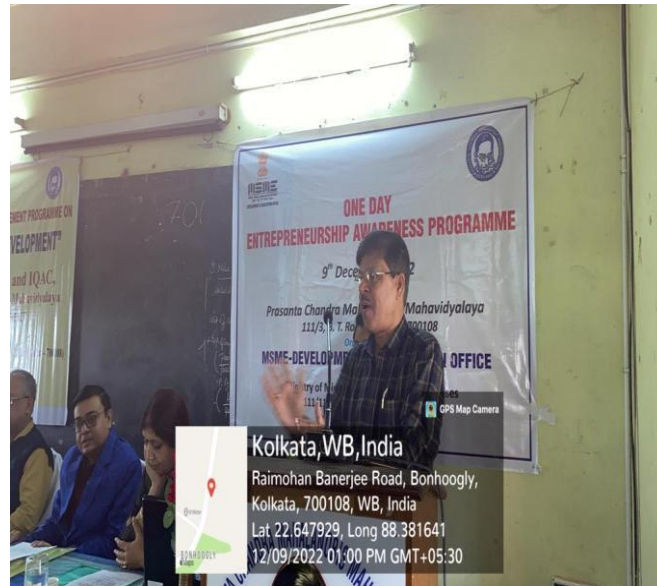
Speech delivered by Resource person

Agsh Principal Prasanta Chandra Mahalanobis Mahavidyaaya 111/3, B. T. Road, Kolkata-108