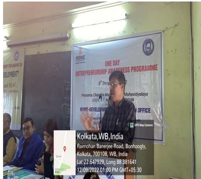
Speech delivered by Resource person

Agwsh Principal Prasanta Chandra Mahalanobis Mahavidyaaya 111/3, B. T. Road, Kolkata-108