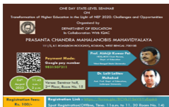
Photo of the banner