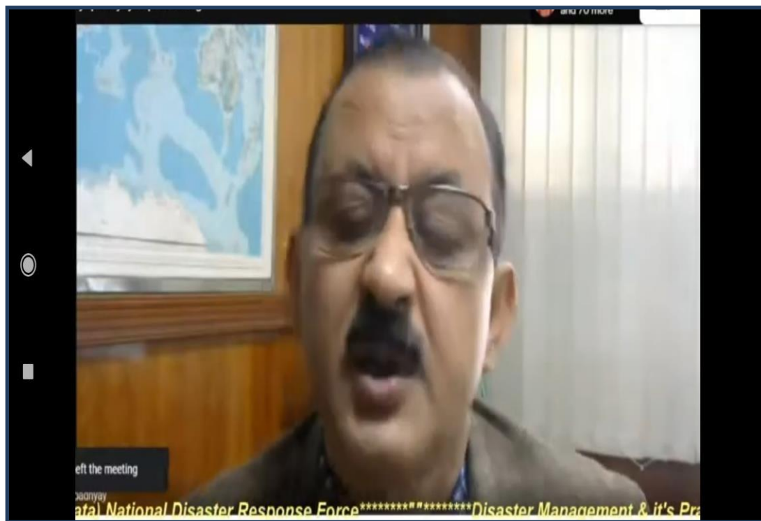
Photo Of lecturer presenting his lecture