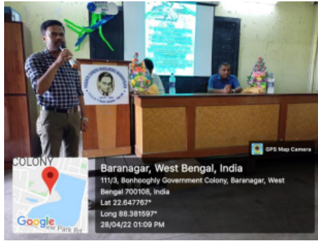
The Seminar in Progress