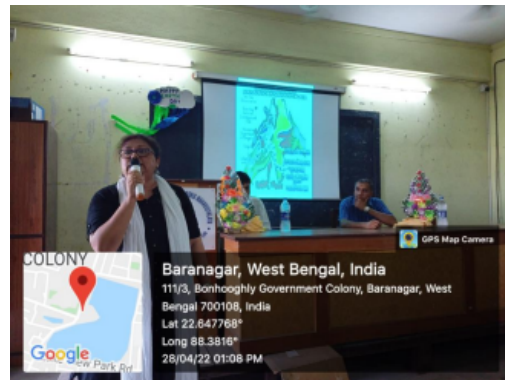
The Seminar in Progress