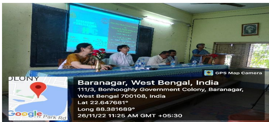
Geo-tag photo of all resource persons