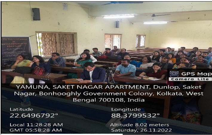
Participants of the Seminar