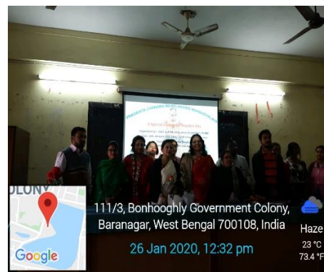
Commencement of the talk