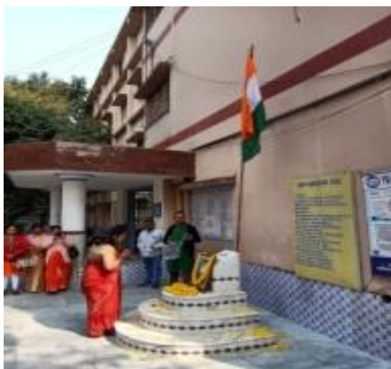
Flag Hoisting Ceremony