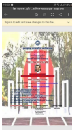
Banner of the Webinar