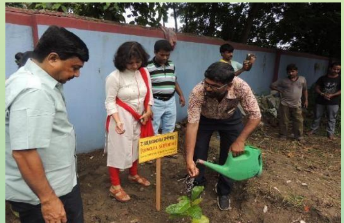
Figure 2: World Ozone Day Celebration