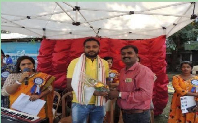
Figure 8: WBSU Inter College Competition