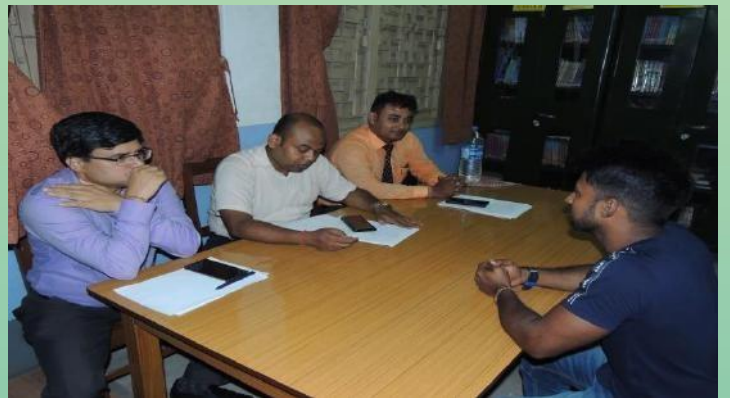
Figure 9: On-Campus Placement Programme