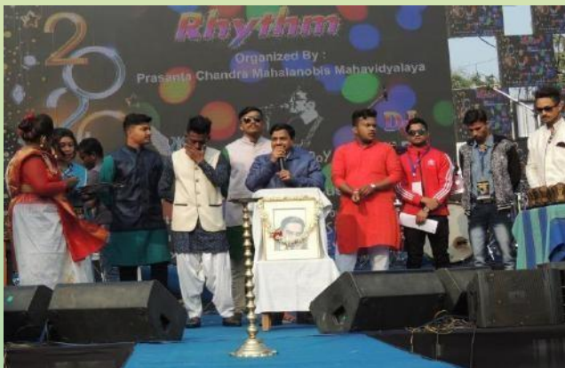
Figure 14: College Freshers' and Social