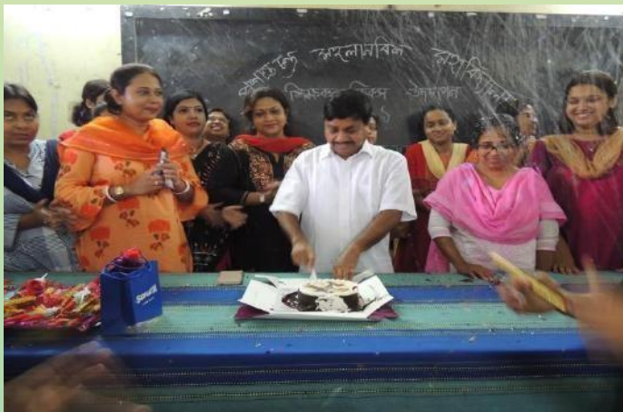
Figure 1 : Teachers' Day Celebration