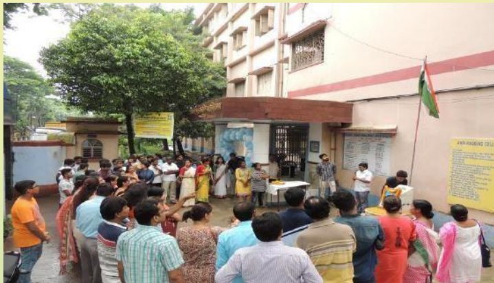
Figure 13: 15 th August Flag Hosting