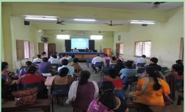
Figure 17: School Meet Programme