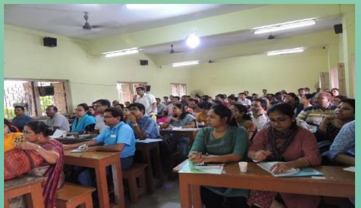
Figure 11: CAS Seminar