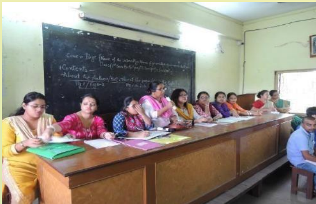
Figure 12: Student Guardian Meeting