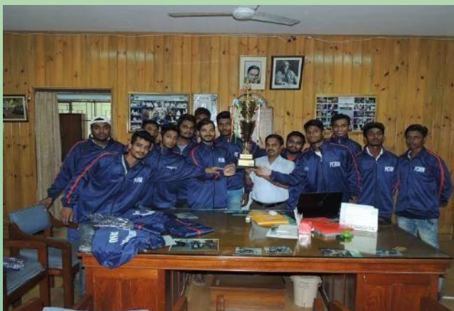
Figure 16: College Football Team