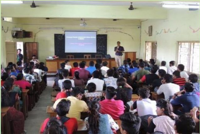
Figure 6: Library Awareness Programme