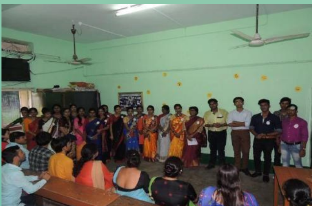
Figure 10: Food and Nutrition Week