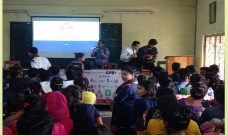
Figure 5: Job Orientation Program