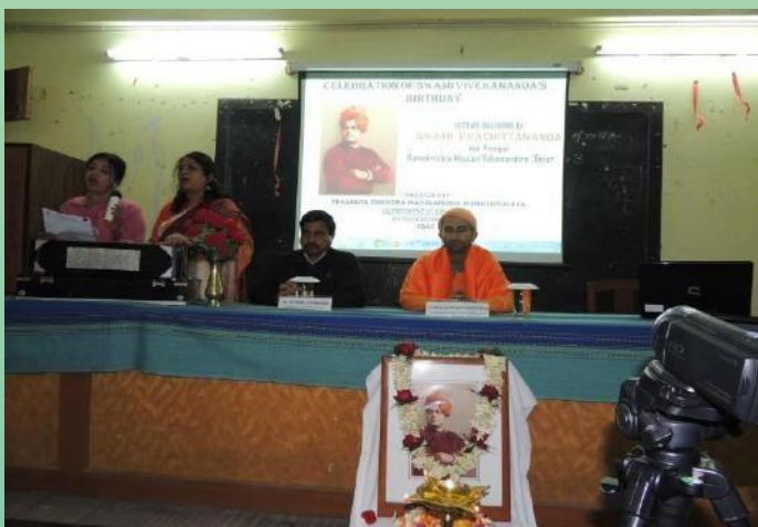
Figure 3: Vivekananda Birth Day Celebration