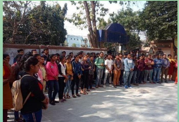
Figure 4: Pulwama Sahid Swarane