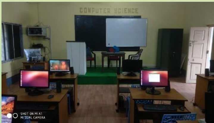
Figure 15: Computer Science Department