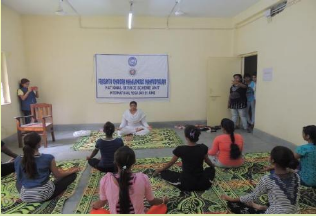
Figure 4: International Yoga Day Celebration